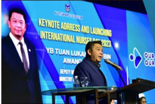
Opening Speech By YB Dato Lukanisman bin Awang Sauni