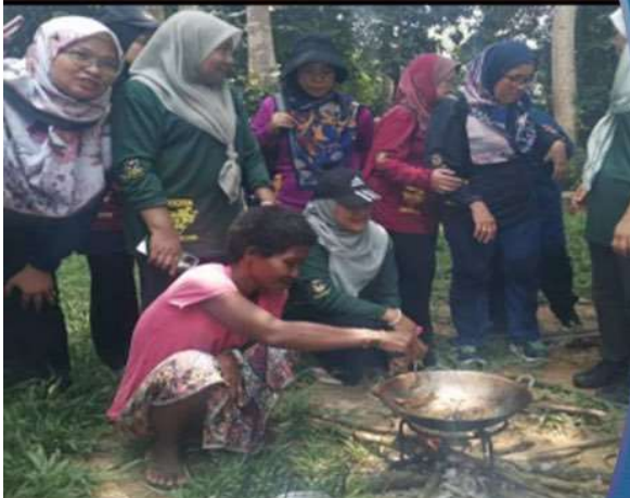
Aktiviti Bersama Orang Asli