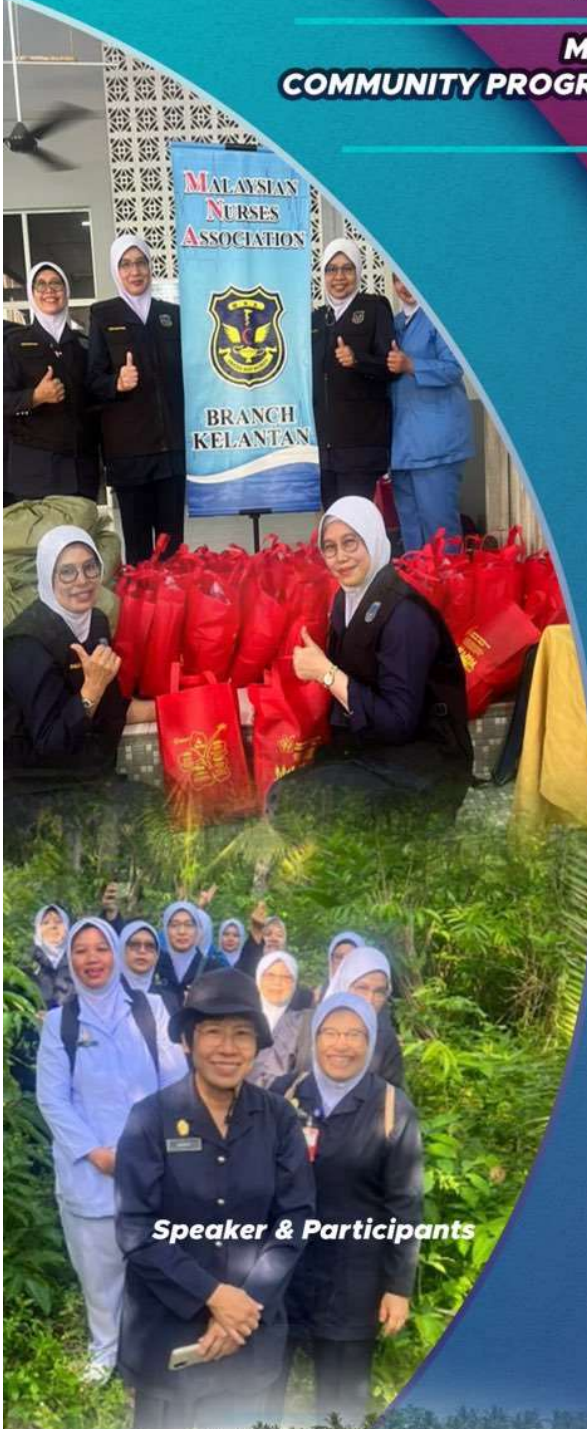
Speaker & Participants

The program's activities included home visits to three antenatal cases and one case of malnourished children (KZM). On June 1, 2023, a collaborative program with the villagers in Teluk Renjuna was held in partnership with the Teluk Renjuna Health Clinic at Al-Ahmadiyah Mosque, Pulau Teluk Renjuna. Community-focused activities encompassed health education, health screenings, breast examinations, a healthy cooking competition, a colouring competition for children, a lucky draw, and rice pack donations. Appreciation prizes were distributed to all participants who engaged in the competitions. The program unfolded seamlessly, reaching its successful completion, contributing positively to community health awareness and reinforcing the bonds among healthcare professionals at various levels.