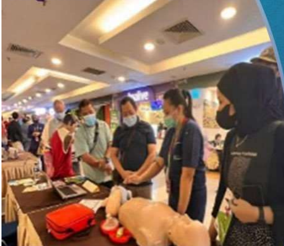
Education on how to perform CPR