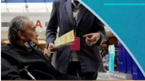
Education to patient on fall prevention measure

Furthermore, the event emphasized the diverse and evolving roles within the nursing profession, such as the responsibilities of nurse educators and fall-link nurses specific to the context of IJN. This celebration effectively instilled a sense of pride within the nursing community, providing the public with the opportunity to appreciate and understand the extensive responsibilities shouldered by nurses. Ultimately, the booth activities successfully combined education, engagement, and appreciation towards nurses. By providing a platform for people to express their gratitude and engage with the world of nursing, the event underscored the indispensable contributions of nurses to the quality healthcare.