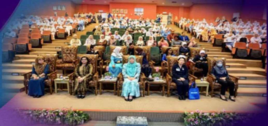
300 participants in the Auditorium Sri Perdana