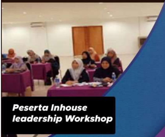
Peserta Inhouse leadership Workshop