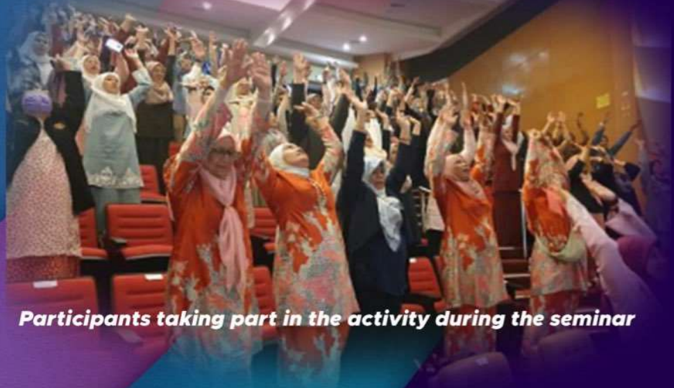
Participants taking part in the activity during the seminar