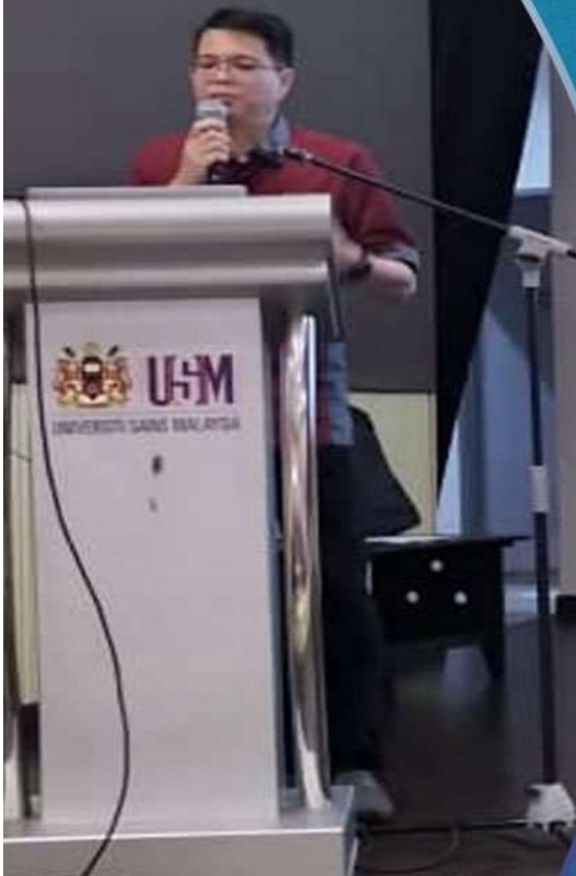
Speaker & Participants

By fostering collaborations with financial institutions like Bank Islam, the Malaysian Nurses Association demonstrated a commitment to empowering its members with the necessary tools and knowledge to navigate the complexities of financial management successfully.