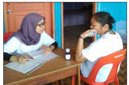
MNA Sarawak Branch Chairman in action - Screening Counter

Sarawak Branch carried its fourth community service on 20 July 2018. The team flew to Bintulu then continue the journey to Long Urun, Belaga Sarawak. That place can only be reached by using heavy-duty 4-wheel drive landcruiser. The journey took about 6 hours along a rugged land route. This outreach program aimed to provide Health screening to the rural communities. It included checking of blood pressure, blood glucose monitoring and hair inspection for head lice. Along with that, Clinical Breast Examination was conducted. Treatment for minor ailments were rendered. The team comprised of Medical doctors, dental nurses and 12 MNA members. The activities were carried out from 21 July to 22 July 2018. The team successfully screened a total of 793 people (adult and children). It was a great achievement and paid the endurance undergone.