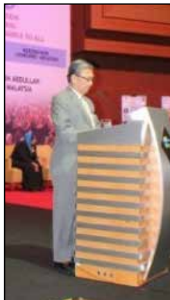
Speech & Launching of IND by YB Deputy DG of Health (Medical)