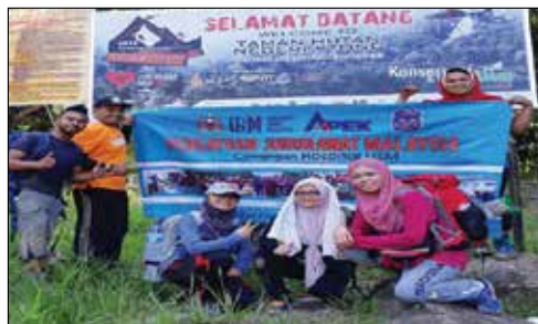
Photo session prior to expedition

On the third day, the entire climber started the expedition back to the foot of the mountain and reached safely at 1700 hrs.