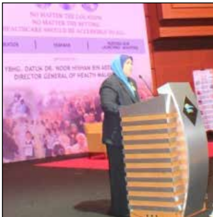
Welcoming Speech by MNA President