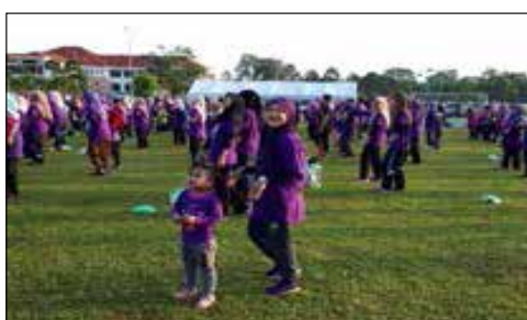
Participants taking part in aerobic