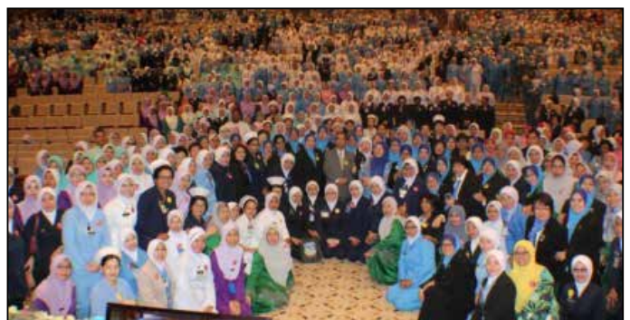
Distinguish Guest with Nurses