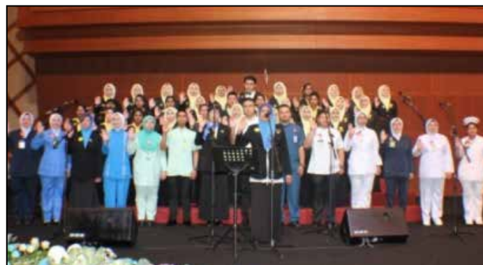
Reciting of IKRAR