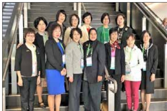
ASIORNA Board Members from various countries

Looking forward for the next events that is ASIORNA Board Meeting and celebration of ASIORNA 10th Anniversary 2019 in Kuala Lumpur and 7th ASIORNA Conference & 9th Asian Perioperative Leadership Forum in Beijing 2020.