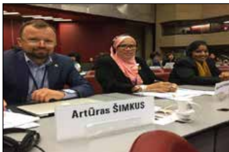
Representatives of ICN'S National Nursing Association

100 representatives from 52 different countries met to discuss ways in strengthening NNA's policy initiatives and implementation and to share experiences and good practices.