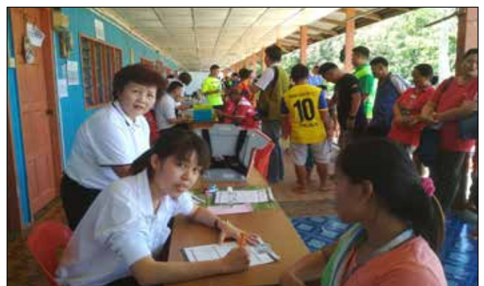
Local Community lining up to be screened