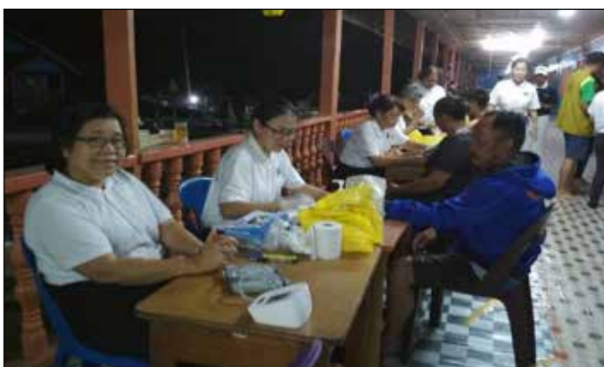
Blood Glucose monitoring counter