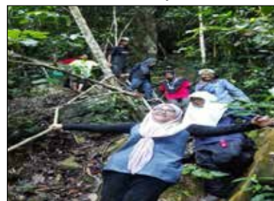
Be careful - descending