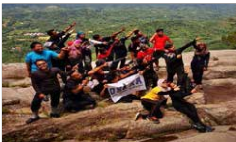
At the top of the mountain