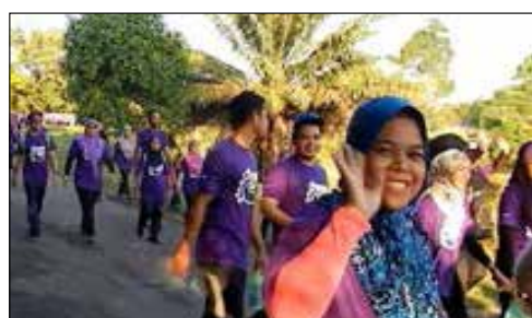
Still smiling at 2.2 kilometer