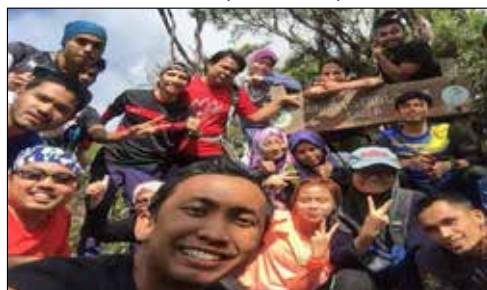
Happy faces of the climbers