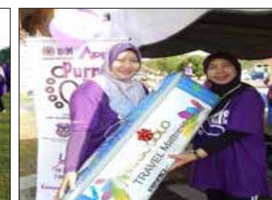
Lucky draw winner