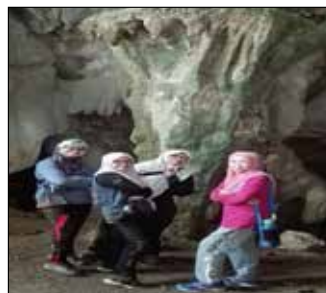
The cheerful ladies