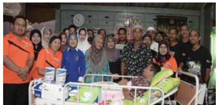
Visit to a Patient's Home