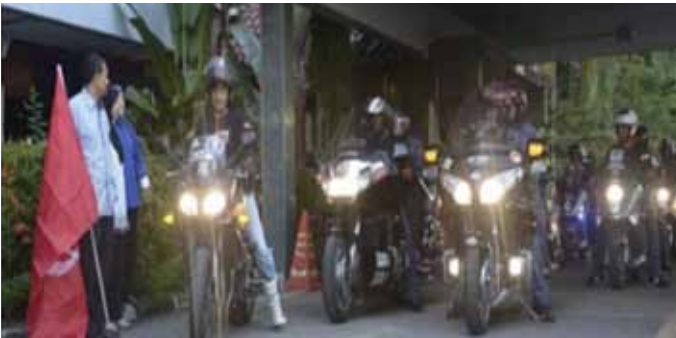
Charity ride with Kelantan K3 Riders