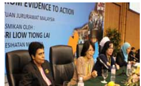
Forum: Closing the Gap – From Evidence to Action