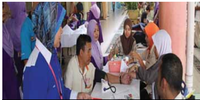
Blood donation drive by MNA HUSM members