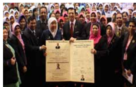
Greeting Card from Prime Minister of Malaysia