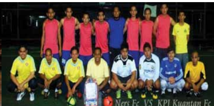
Friendly match between MNA HUSM Branch Futsal Team, Ners FC with Langkawi FC team and KPJ Kuantan FC team.