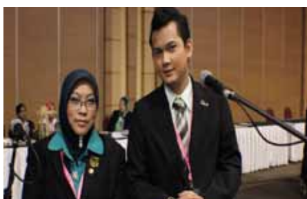
Masters of Ceremony