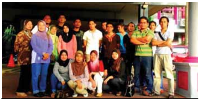
Social Visit to Hospital Langkawi in Kedah