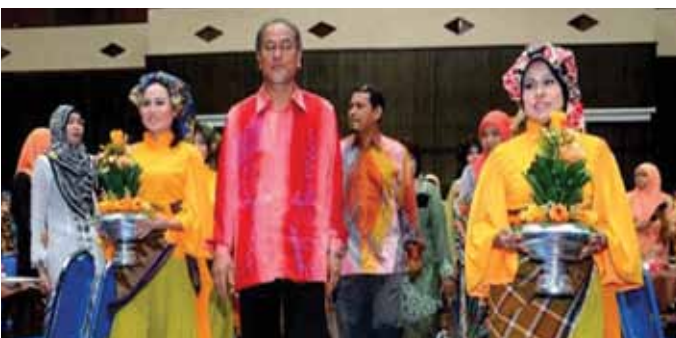
MNA HUSM Dinner: Arrival of VIP