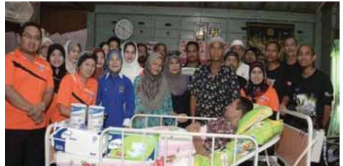
Visit to a Patient's Home