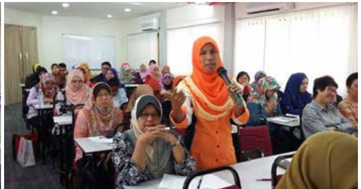
A participant shares her experience of a disaster event