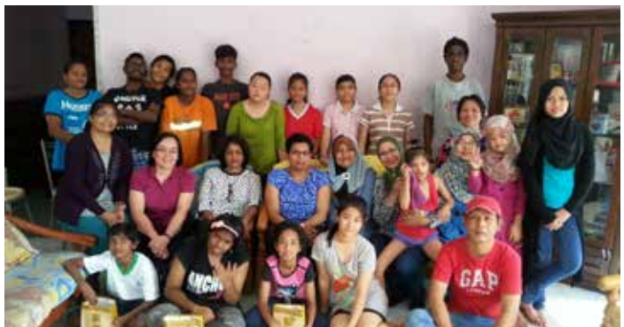
Let us beat the stigma against PLWHA!